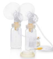
Symphony Pump Set