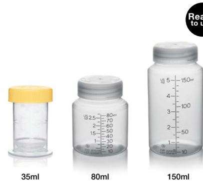
Disposable Breastmilk Bottles