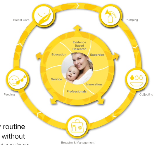
Breastfeeding Solution Circle

With its Ready-to-Use product range, Medela greatly simplifies the daily routine involved in breastfeeding. All these products can be used straight away without cleaning prior to first use. This supports hygiene and is safe to use. Cost savings are likely due to the elimination of the time, cost and energy-intensive sterilisation/ disinfection process.